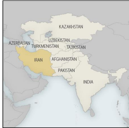
Figure 4. South and Central Asia Region

The lifting of sanctions on Iran in 2016 contributed to Azerbaijan's modification of its policy toward Iran. In August 2016, Azerbaijan's President Ilham Aliyev hosted Rouhani and Russia's President Vladimir Putin to a "Baku Summit," in which a major topic was a long-discussed "North-South Transport Corridor" involving rail, road, and shipping infrastructure from Russia to Iran, through Azerbaijan. In December 2016, President Rouhani visited Armenia to discuss a Persian Gulf-Black Sea transit and transport corridor. 126 However, any such projects are likely on hold due to the reimposition of U.S. sanctions in 2018.