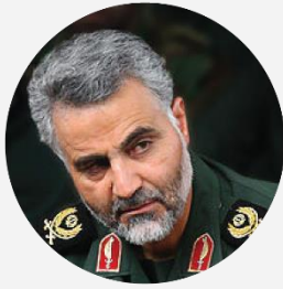
IRGC Major General Qasem Soleimani