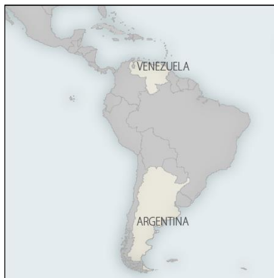
Figure 5. Latin America

The countries in which Iran appears to have sought to exert influence or retain the option, likely in partnership with Lebanese Hezbollah, for terrorist attacks include Venezuela, Argentina, and Cuba. U.S. counterterrorism officials also have stated that the tri-border area of Argentina, Brazil, and Paraguay is a “nexus” of arms, narcotics and human trafficking, counterfeiting, and other potential funding sources for terrorist organizations, including Hezbollah. In the 112 th Congress, the Countering Iran in the Western Hemisphere Act (H.R. 3783, P.L. 112-220) required the Administration to develop a strategy to counter Iran’s influence in Latin America, which was provided to Congress in June 2013. 155