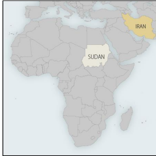
Figure 6. Sudan

The IRGC-QF has reportedly operated in some countries in Africa, in part to secure arms-supply routes for pro-Iranian movements in the Middle East but also to be positioned to act against U.S. or allied interests and to support friendly governments or factions. Several African countries have claimed to disrupt purportedly IRGC-QF-backed arms trafficking or terrorism plots. In May 2013, a court in Kenya found two Iranian men guilty of planning to carry out bombings in Kenya, apparently against Israeli targets. In December 2016, two Iranians and a Kenyan who worked for Iran's embassy in Nairobi were charged with collecting information for a terrorist act after filming the Israeli embassy in that city. Senegal cut diplomatic ties with Iran between 2011 and 2013 after claiming that Iran had trafficked weapons to its domestic separatist insurgency.