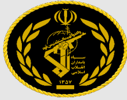
Table 4. The Islamic Revolutionary Guard Corps (IRGC)

The IRGC is generally loyal to Iran's political hardliners and is clearly more politically influential than is Iran's regular military, which is numerically larger, but was held over from the Shah's era. The IRGC's political influence has grown sharply as the regime has relied on it to suppress dissent. A Rand Corporation study stated: "Founded by a decree from Ayatollah Khomeini shortly after the victory of the 1978-1979 Islamic Revolution, Iran's Islamic Revolutionary Guards Corps (IRGC) has evolved well beyond its original foundations as an ideological guard for the nascent revolutionary regime.... The IRGC's presence is particularly powerful in Iran's highly factionalized