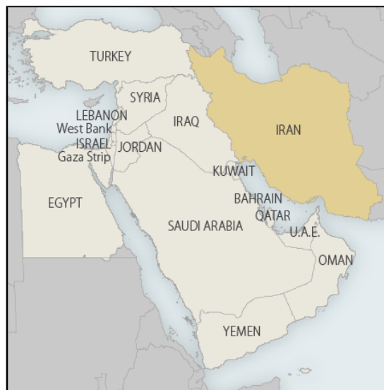
Figure 2. Map of Near East

Iran has a 1,100-mile coastline on the Persian Gulf and Gulf of Oman, and exerting dominance of the Gulf has always been a key focus of Iran's foreign policy, including during the reign of the Shah. In 1981, perceiving a threat from revolutionary Iran and spillover from the Iran-Iraq War that began in September 1980, six Gulf states—Saudi Arabia, Kuwait, Bahrain, Qatar, Oman, and the United Arab Emirates—formed the Gulf Cooperation Council alliance (GCC). U.S.-GCC security cooperation expanded during the 1980-1988 Iran-Iraq War and became formalized after the 1990 Iraqi invasion of Kuwait. Prior to 2003, the extensive U.S. presence in the Gulf was in large part to contain Saddam Hussein's Iraq but, with Iraq militarily weak since Saddam's ouster, the U.S. military presence in the Gulf focuses primarily on containing Iran and conducting operations against regional terrorist groups.